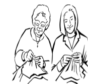
Women's Guild Prayer Shawl Ministry

Board of Service Ministries meets Monday, June 1 at 7:00 pm