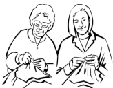
Women's Guild Prayer Shawl Ministry

Each time the post office notifies us of an address change, it costs 50¢. Please help the church save money by notifying the office of any address changes before the Post Office does. Thank you!